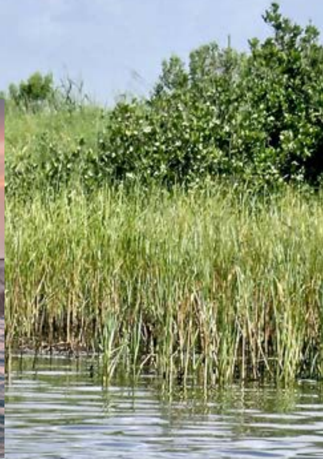
Tailing redfish in Barroom Bay