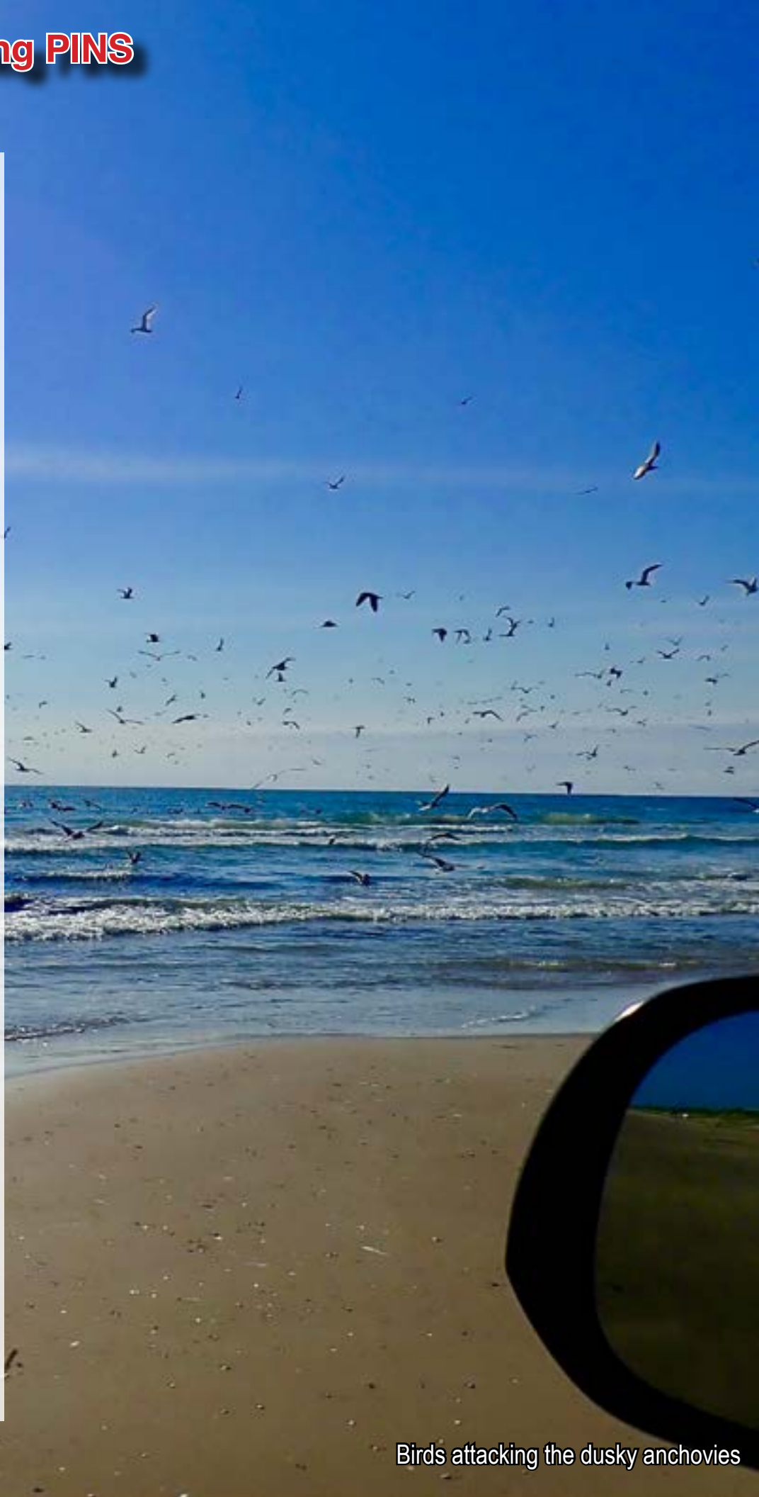
Birds attacking the dusky anchovies

As you may know, just past the Visitors Center at the park the asphalt road disappears and the sandy beach becomes the highway all the way to the Mansfield Jetty about 65 miles south. On this day, we were in luck. The sand was hard, the winds low, the water was clear, no red tide, and we had sunshine. As we drove south, we didn't see much of anything happening in the surf. Then, we spotted birds working the first gut at around the 30-mile marker. That was our cue. I stopped the car and jumped out, rigged up, and started casting into the melee. Because of an unusually high tide, the anchovies were hugging the shore in just inches of water. This meant that only small predatory fish and birds were attacking these schools –little jacks, small ladyfish, and whiting. When the schools are out past the first gut in the deeper water, Spanish mackerel, jacks, and large ladyfish will attack the schools. On this trip, we