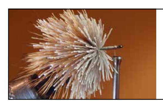
Step 6: Wrap the hook shank with several layers of thread to the hook eye, tie off and clip the thread. This thread base will provide a good surface for gluing the head.