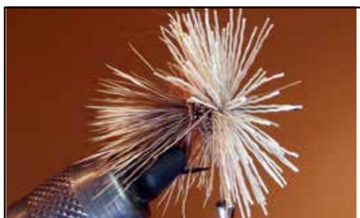
Step 3: Clean and spin a small clump of antelope hair in front of the tail.

Step 2: Start the thread just before the bend of the hook and make a small thread bump to help keep the tail and hair clumps from sliding off the back of the hook. Clean and stack a small bunch of deer body hair (about the size of a pencil) and trim to length. The tail should be about the length of the hook shank. Use deer for the tail because antelope isn't quite as durable Slide the hair in place over the hook and tie it in just in front of the thread bump. Hold this clump firmly to keep it from spinning around the hook while you tighten the thread. Move the thread forward and secure with a half hitch.