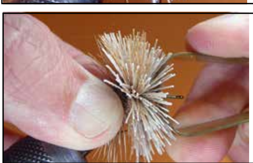
Step 4: Compress this clump with a packer being sure to support the tail to keep from pushing everything off the back of the hook. Continue cleaning, spinning, and packing clumps of antelope until you have just enough room for the foam head.