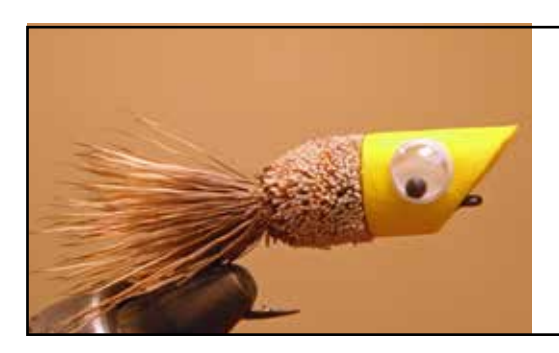
Step 9: Using Krazy glue, attach a 5mm or 6mm doll eye to each side of the foam head. The completed Llanolope.