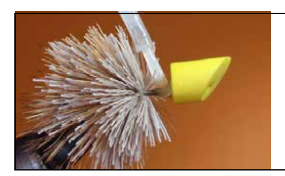
Step 8: Pull the head back and let it rest on the eye of the hook. Coat the thread and the back of the foam head with Krazy glue and push the head back into place.