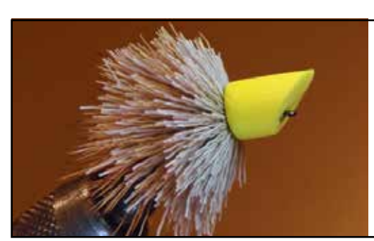
Step 7: Press the head over the eye of the hook and make sure it fits correctly. You can make minor adjustments by trimming the foam if necessary.