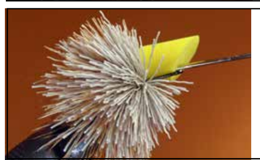
Step 5: Make sure you have enough space on the hook shank for the head you prepared in step 1. You can do this by laying the head against the hook shank to ensure it will fit.