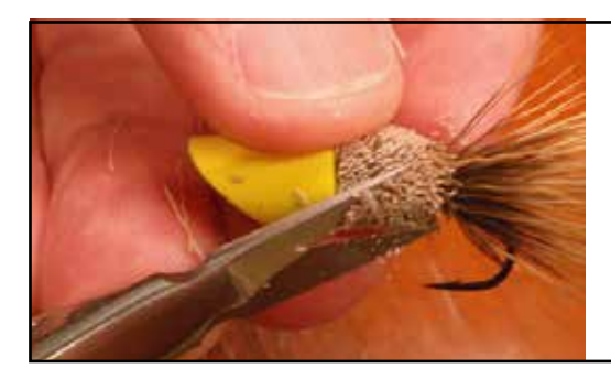
Step 9: Trim the hair following the profile of the foam head. Be careful not to trim off the tail.