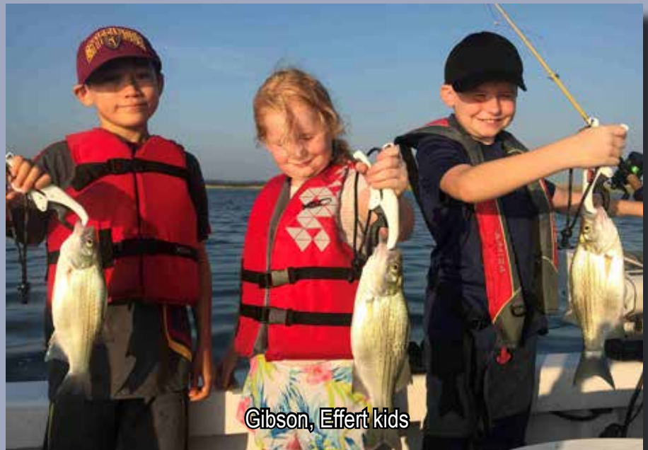
Gibson, Eggert kids