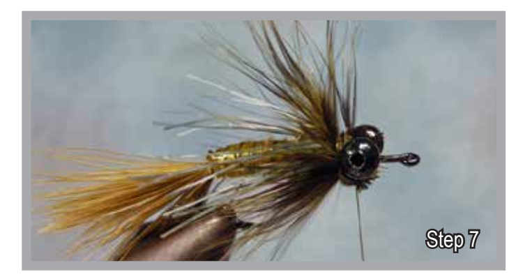
Step 7: Behind the eye, tie in the tip of a hen hackle feather, wrap it around the hook and tie it off.