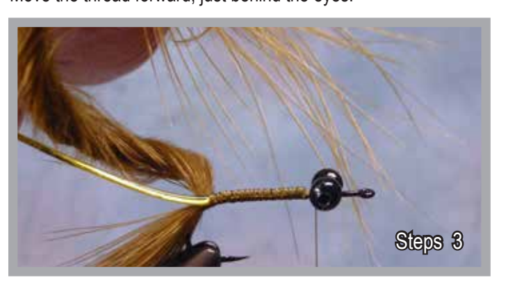
Step 3: Tie in the vinyl rib, leaving it hanging off the back of the fly. Move the thread forward, just behind the eyes.